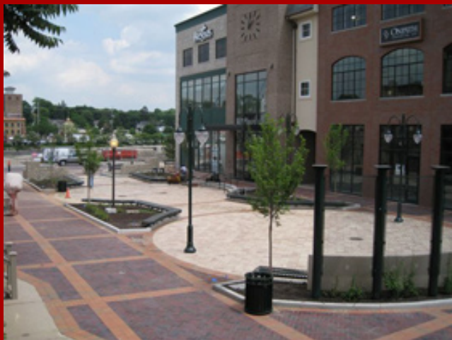
Above: Newly completed First Street Plaza is just south of Main Street, with pedestrian access from First Street.

www.stcharlesil.gov www.1ststreetstc.org www.st-charles.il.us